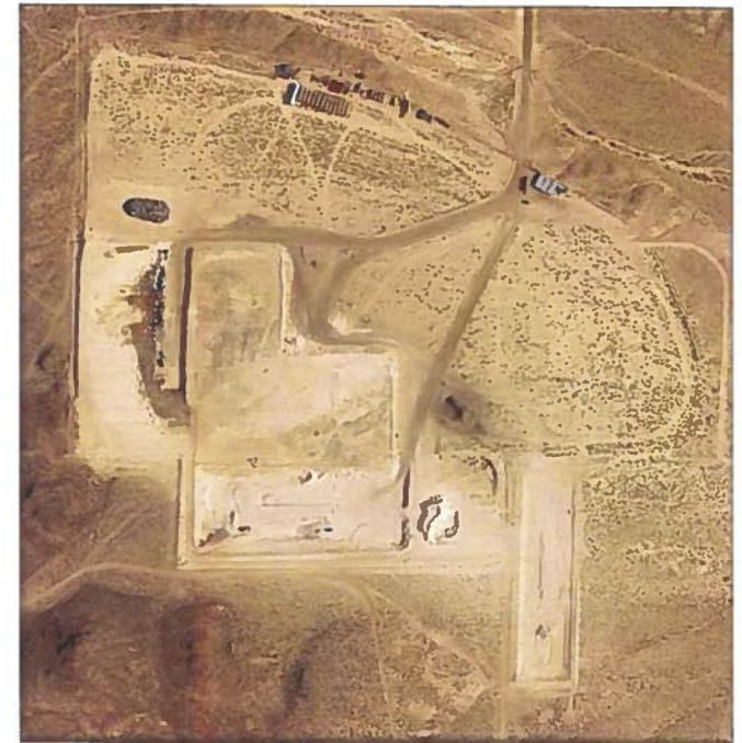
Pictured: Tonopah Landfill

Proactive measures are necessary to ensure the system's financial sustainability, maintain regulatory compliance, and safeguard public health and the local environment.